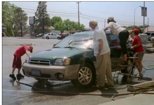
A dedicated team made the car wash a success.