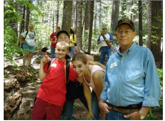
A big group of mentors and mentees enjoyed our hike in the South Grove at Calaveras Big Trees State Park.